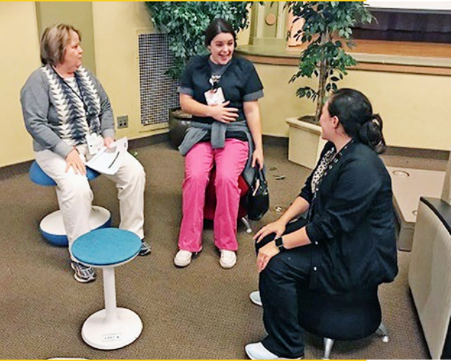
Staff tested the furniture in a very hands-on manner.

Along with construction, many discussions are underway regarding the building signage, playground equipment, furniture, fixtures and equipment. In mid-November, a furniture fair was conducted for the staff at Larue Carter Memorial Hospital and other agency leadership, so potential furniture that will go inside the NDI could be evaluated. Manufacturers that specialize in furniture specifically designed for use in behavioral health facilities had several pieces on display. This furniture is designed with safety in mind first and foremost. Pieces like chairs tend to be heavy enough so they can't be picked up and thrown, for example, and smaller pieces can be weighted down with sand.