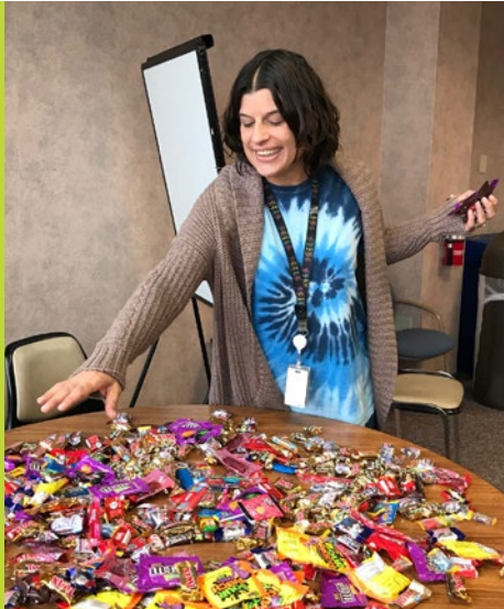
The special projects employee events committee raised $1,353 to help fellow DDB employees in Puerto Rico.

The Disability Determination Bureau has a special projects employee events committee, which initiates fundraisers and other events throughout the year for DDB staff. After the devastation in Puerto Rico caused by Hurricane Maria last September, the committee voted to initiate a fundraiser to help their fellow DDB counterparts in Puerto Rico, as their office was completely destroyed. Like Indiana, the Social Security Administration contracts with the Territory of Puerto Rico to process Social Security Disability claims for island residents. The committee raised $1,353 through donations and selling candygrams for a dollar, with notes of appreciation, which were delivered to staff in the building. With assistance from the SSA's New York Regional Office, DDB was able to make contact with the Puerto Rican staff, and the funds were sent at the end of December.