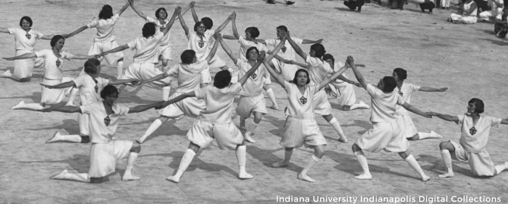
Indiana University Indianapolis Digital Collections