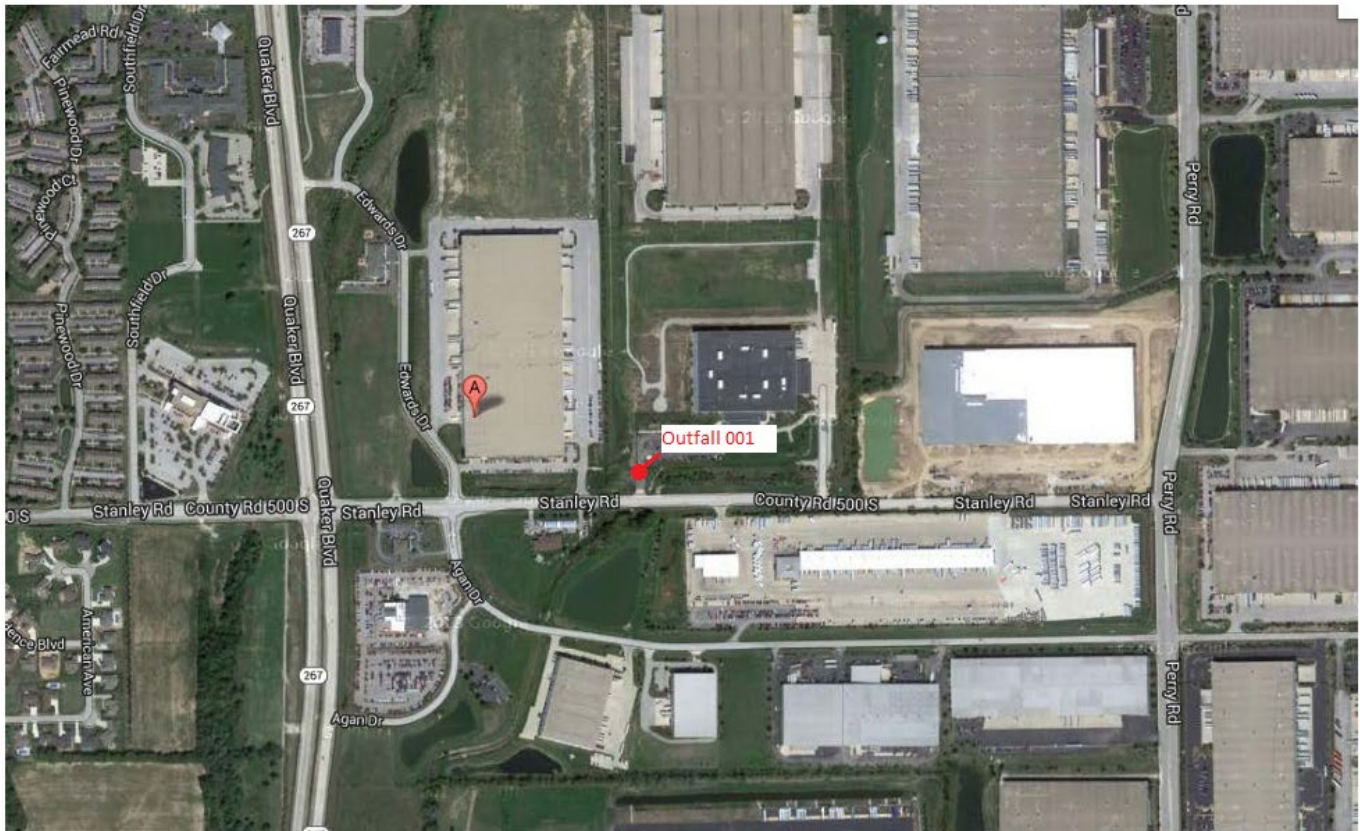
Figure 1: Facility Location

2150 Stanley Road, Suite 151 Plainfield, IN Hendricks County