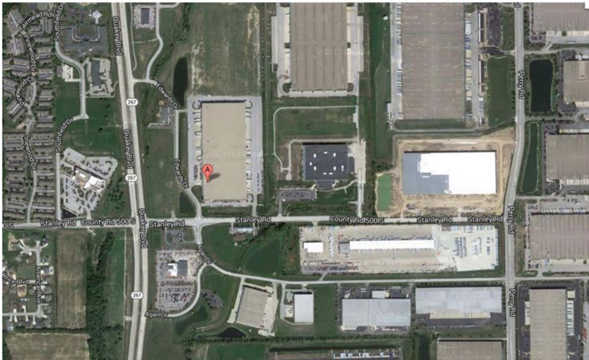
Figure 3: Site Map

A Site Map has been included as Figure 3.