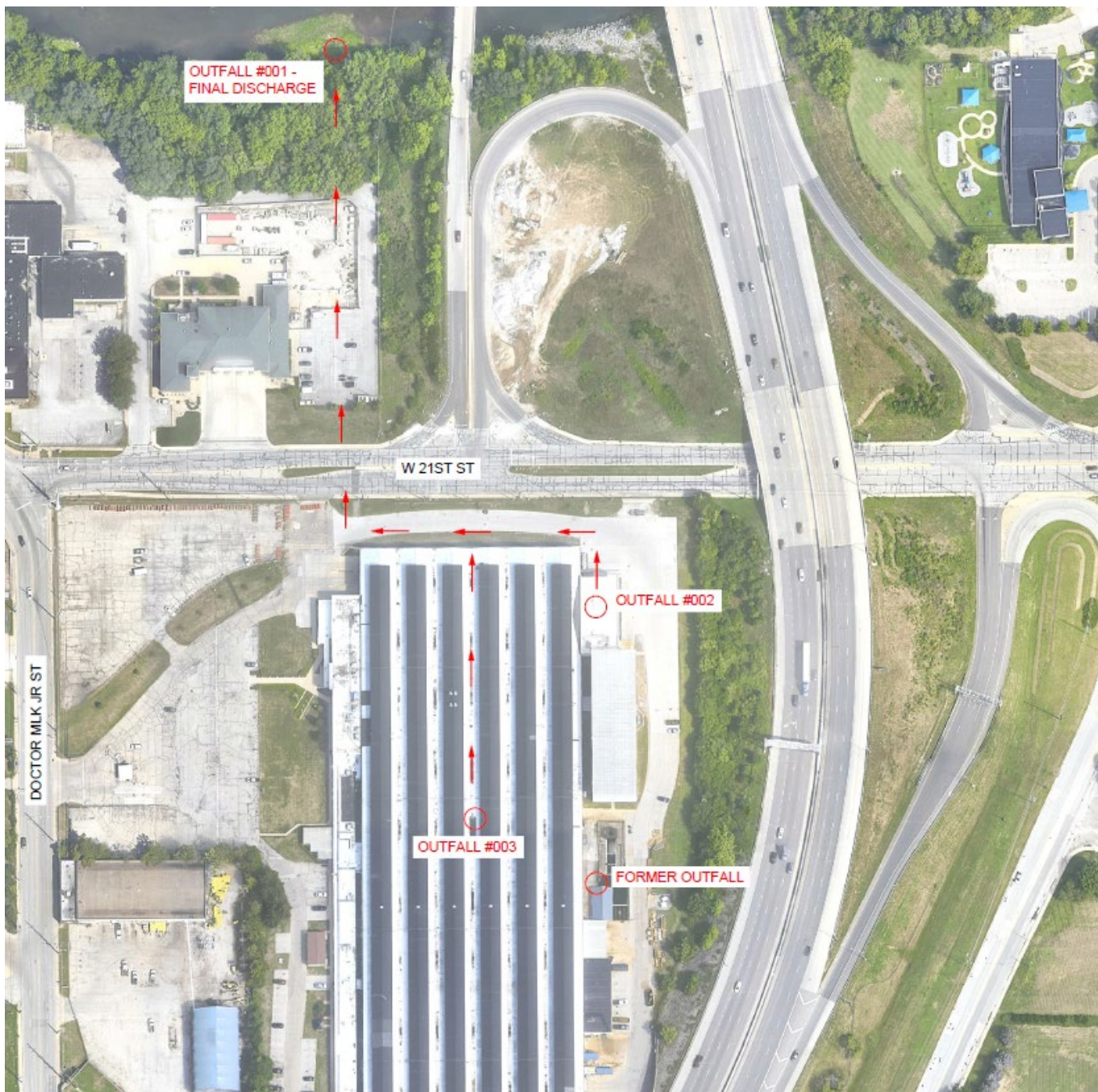
2005 Dr. Martin Luther King Jr. Street Indianapolis, IN – Marion County