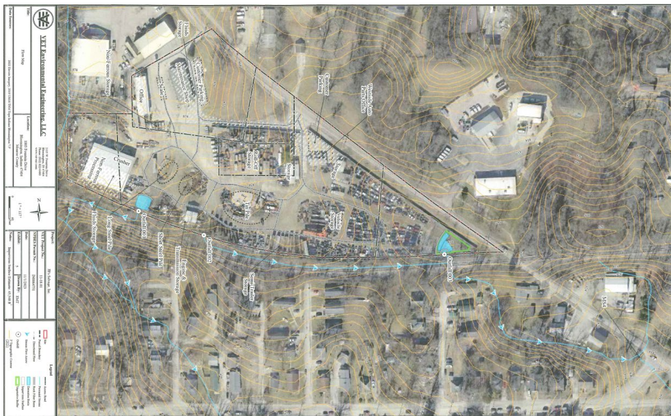
Figure 2: Site Map