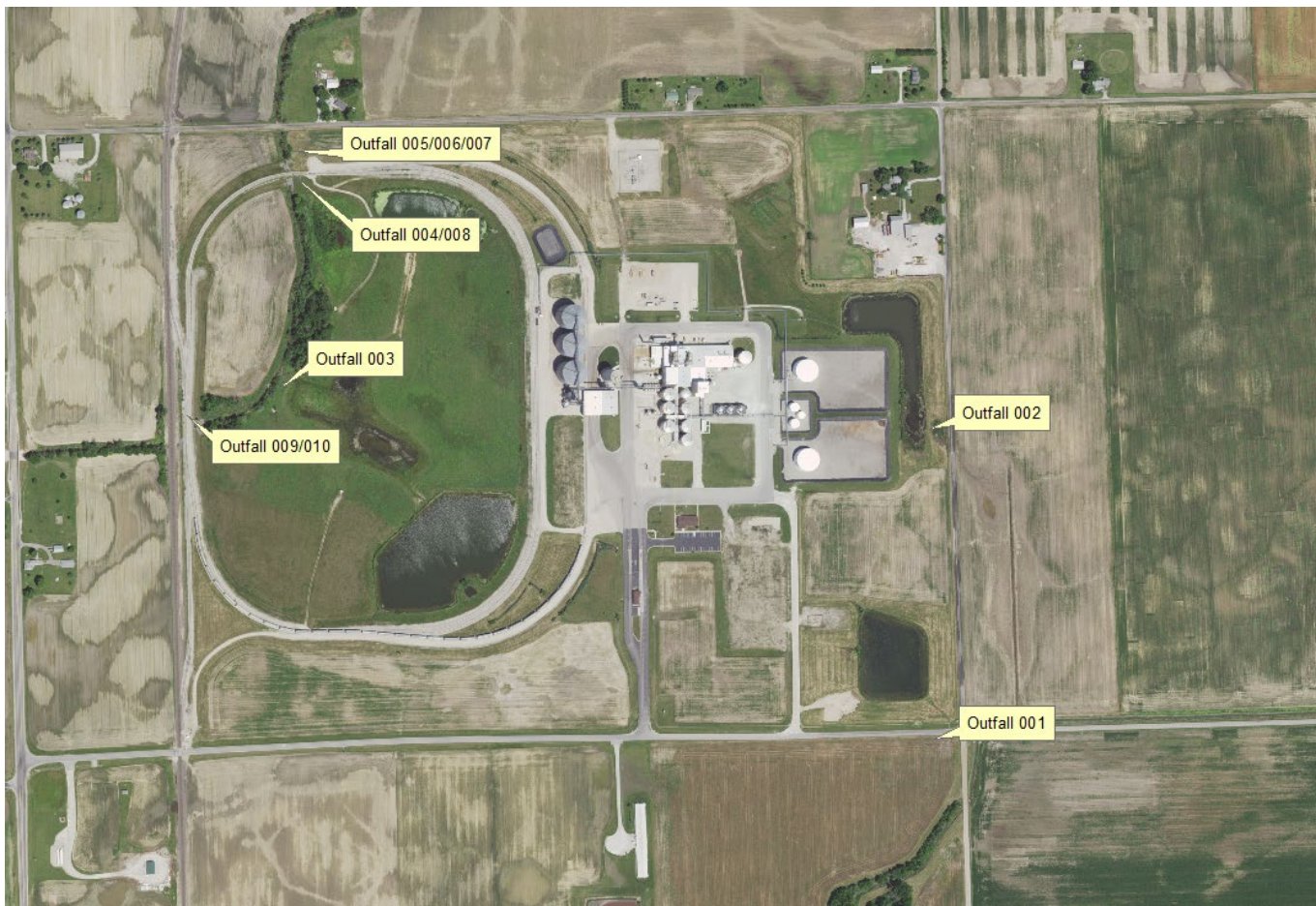
Figure 1: Facility Location/Site Map

868 East 800 North North Manchester, IN 46962 Wabash County