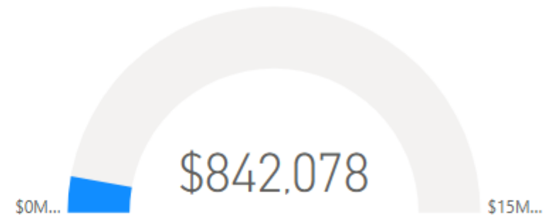
13-100 Compartments Amt Reimbursed