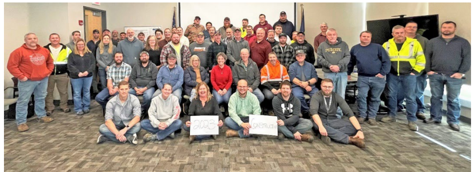
Fort Wayne District Construction Conference attendees gather during a break.