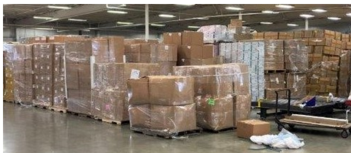
Boxed supplies inside a warehouse at Stout Field await delivery by INDOT.