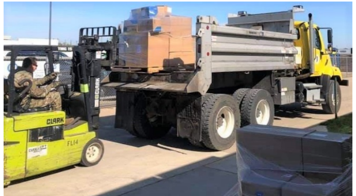
To transport needed supplies to combat COVID-19, INDOT has used dump trucks (top photo), cargo vans (middle photo) and box trucks (bottom photo).

Although there is no typical day at Stout Field, Sadler is provided with delivery location of supplies to various sites around the state daily. Sadler determines the size of each shipment and coordinates with Szewczak to obtain the necessary manpower and, possibly, INDOT vehicles to transport. From mid-August to mid-September, this has averaged to between 25 and 30 shipment locations around the state per week.