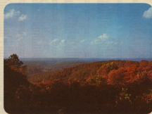
BROWN COUNTY STATE PARK