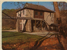
MILL AT SPRING MILL STATE PARK