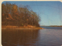
GEIST RESERVOIR LAKE