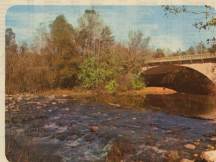
BRIDGE OVER FALL CREEK, STATE ROAD 303