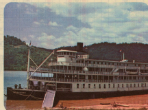
OHIO RIVER BOAT NEAR MADISON