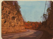
STATE ROAD 36—HANDOVER HILL NEAR MADISON