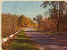
37A NORTH OF INDIANAPOLIS