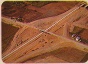
CONSTRUCTION WORK AT STATE ROAD 4 AND INTERSTATE 69 ON DEKALB COUNTY LINE