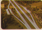
REST PARK ON INTERSTATE 69 TWO MILES NORTH OF DEKALB-ALLEN COUNTY LINE