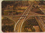
U.S. 31 AND INTERSTATE 465 INTERCHANGE SOUTH OF INDIANAPOLIS