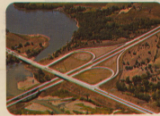
INTERSTATE 70 AND STATE ROAD 227 INTERCHANGE NORTHEAST OF RICHMOND