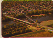
BRIDGE CONSTRUCTION ON STATE ROAD 463 OVER WABASH RIVER AT CLINTON