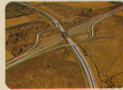
INTERSTATE 69 AND STATE ROAD 158 INTERCHANGE SOUTH OF ANDERSON

No vehicle shall pass a school bus stopped on a highway to load or unload children, except that passing on the opposite lane of a multiple lane highway is permitted, if the lanes are divided by 20 feet or more.