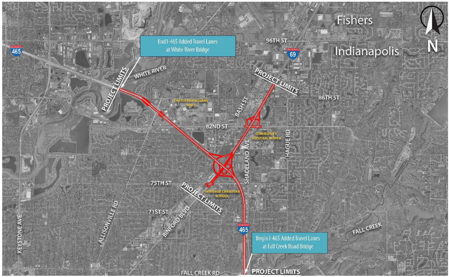
Figure 1-1. Clear Path Project Map