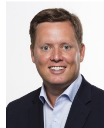
Bret Swanson Economics, Finance, Investments Nomination/Appointment: Governor Term Expiration: 6/30/2025