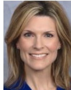
Elise Nieshalla State Comptroller Nomination/Appointment: Self-nominated/Governor Term Expiration: 6/30/2026