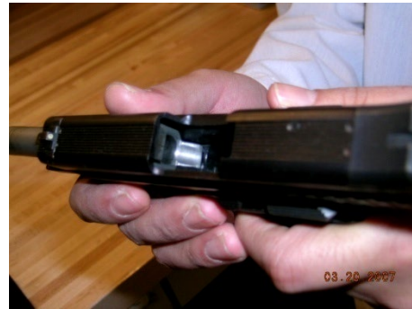
Step 4: Visually inspect the chamber