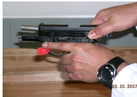
Step 2: Rack the slide to the rear at least 3 times