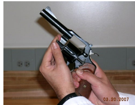
Step 2: Eject any cartridges from chambers