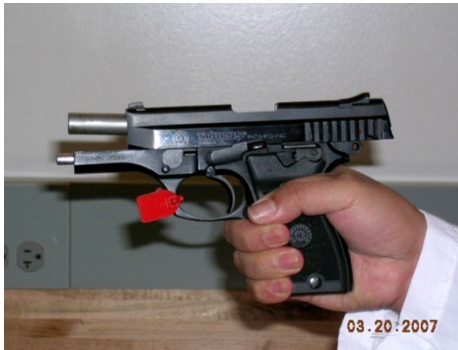
Step 3: Lock the slide to the rear