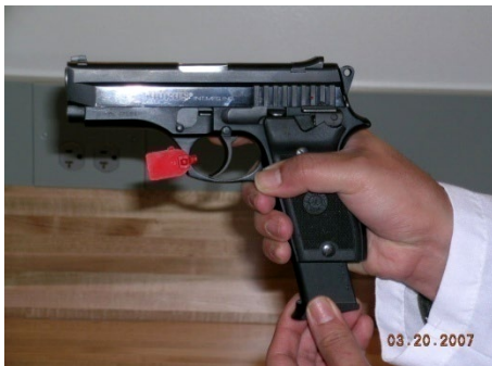
Step 1: Remove the Magazine