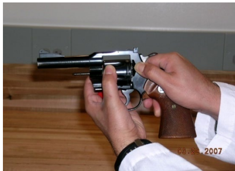
Step 1: Open cylinder