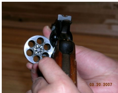
Step 3: Visually and physically check all chambers