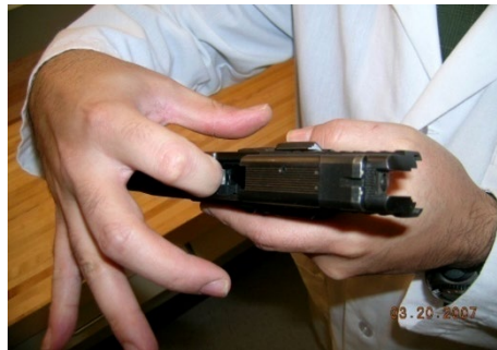
Step 5: Physically inspect the chamber