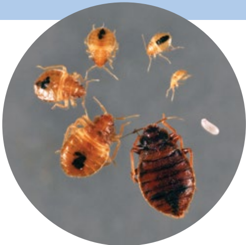
Bed Bug Life Cycle