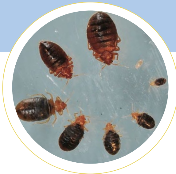
Bed Bugs After Feeding