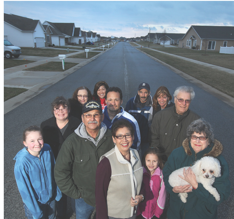
Northwest Indiana neighbors.

Forum on the Future of Northwest Indiana, December 2008 Goal Setting Work Groups, May - June 2009 Subregional Cluster Workshops, September - October 2009 Regional Scenarios Stakeholder Workshops, September 2010 Open Houses, May - June 2011