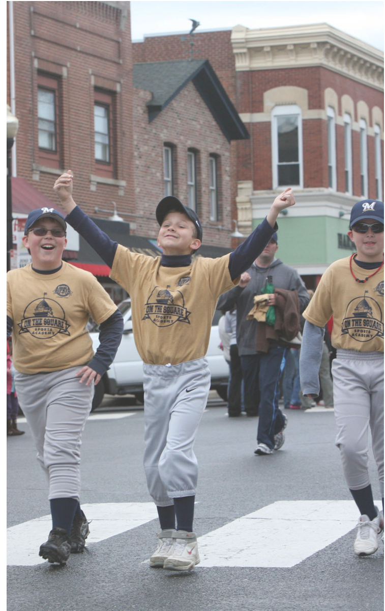
Little League victory parade.