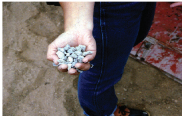
Bentonite material used for well plugging.

Wells must be sealed at or above the ground surface with a welded, threaded or mechanically attached watertight cap. The Division of Water recommends that the well also be completely filled