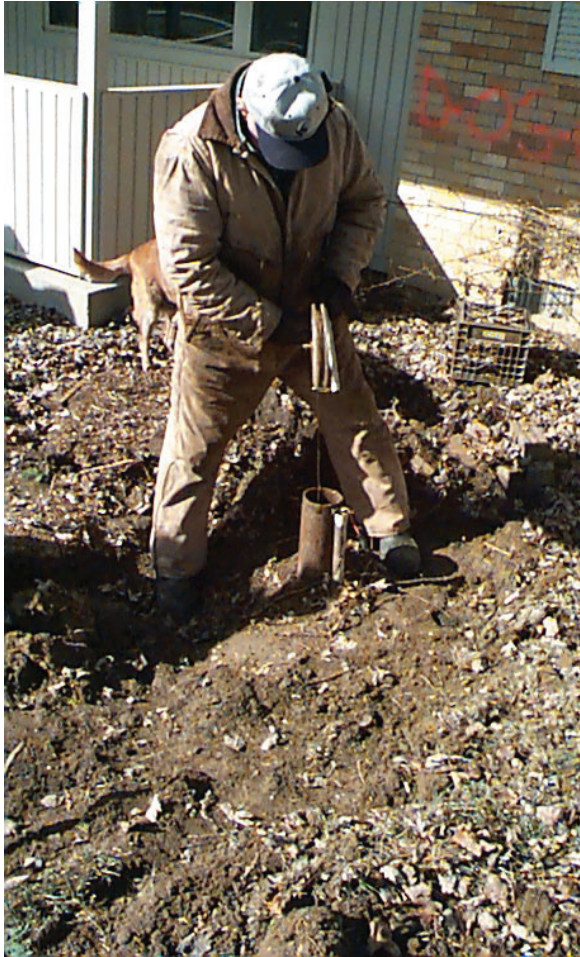
Well depth is determined by a licensed driller/ pump installer prior to plugging.

Indiana Department of Natural Resources Division of Water 402 West Washington Street, Room W264 Indianapolis, IN 46204-2641