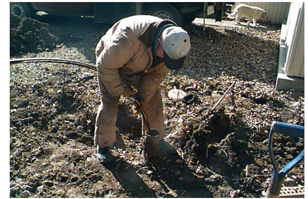
Pump being removed from a well by a licensed driller/pump installer prior to plugging.

with impervious grouting material as specified in 312 IAC 13. A well that poses a hazard to human health must be plugged with impervious grouting material. Large-diameter hand-dug or bucket-excavated wells must be covered at the surface with a reinforced concrete slab or a treated wood cover protected by water-repelling material such as roofing. The Division of Water recommends that the well also be completely filled with clean earth and impervious grouting materials as specified in 312 IAC 13. Sealing or plugging a water well may be difficult. Before attempting the job, a landowner should contact the Division of Water or read the Purdue University Cooperative Extension Water Quality publication "Plugging Abandoned Water Wells: A Landowner's Guide" (WQ-21). This guide, written in cooperation with the Division of Water, is available online in PDF format from the Purdue Extension web site at https://mdc.itap.purdue.edu . Search for it under Natural Resources/Water Quality and Supply. WQ-21-W gives step-by-step instructions on how to seal, disinfect and plug abandoned water wells.