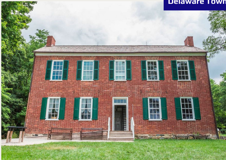
William Conner House at Conner Prairie

200TH BIRTHDAY CELEBRATION EVENT DETAILS ON PAGE 3!